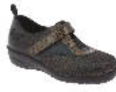
SIBEL p 20