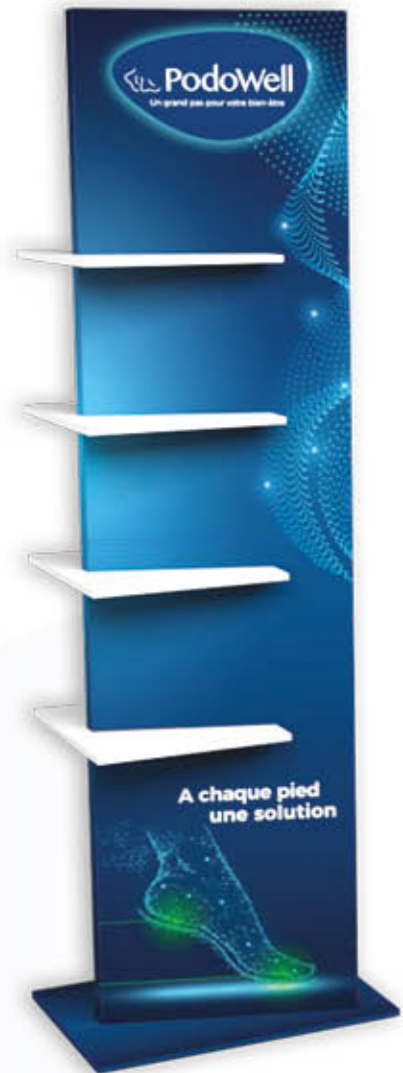
4 SHELVES DISPLAY