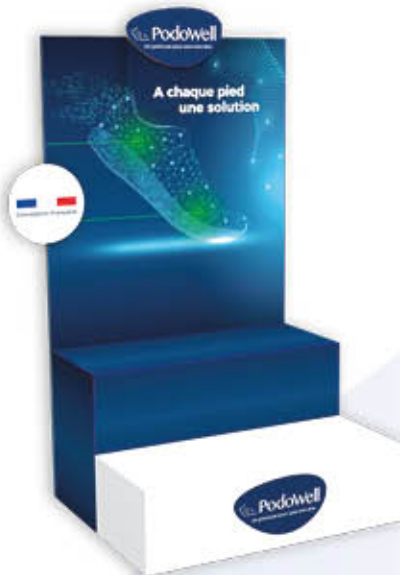
2 SHELVES DISPLAY