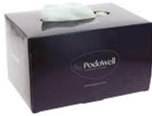
DISPOSABLE SOCKS 60 units, single-size